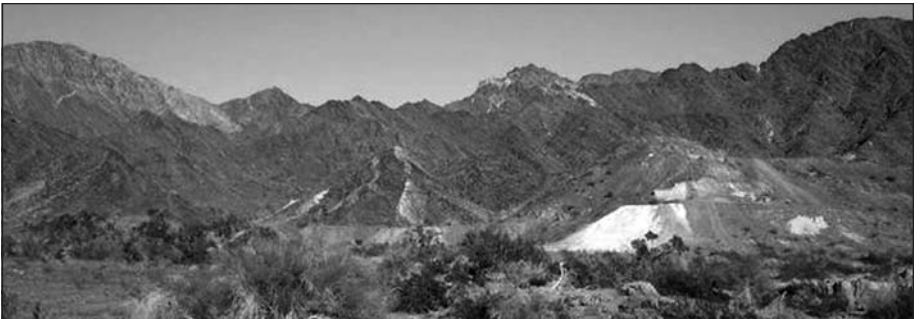
Geology Park LLC

Prospectors may want to concentrate on the canyons and gulches that drain the southern portion of the Chocolate Mountains. This area lies directly east of the old Tumco/Hedges mining camp. A search for gold-bearing float using a high-quality metal-detector may be productive. Careful mapping and tracing of the float may also be useful in the search for the mine.